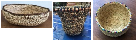
A selection of vessels that consider form, texture and colour and combine basketry techniques, foraged natural materials and fibres, recycled beads, threads and stitching, Prices: $90 - $150

An IOTA'24 artist – Mundaring Arts Centre 20 July – 29 Sept.