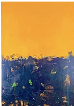
PETER ROSS Sunset over South Beach AWF HOST ARTIST Oil on Canvas 110 x 152cm $4000