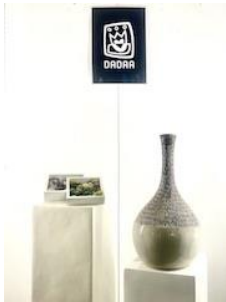
JAKE – a Yamatji Man Textured Ceramic Vessel 14.5 x 24.5cm Forms: Polymer Clay 1 + 2 POA