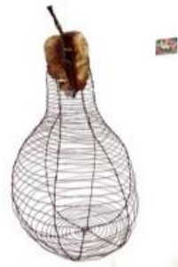
NAT TONKIN AWF'24 GUEST ARTIST The Pear Copper Wire repurposed power line 80 x 60cm $330