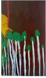
The late DES WOODLEY DADAA Fremantle NOT FOR SALE