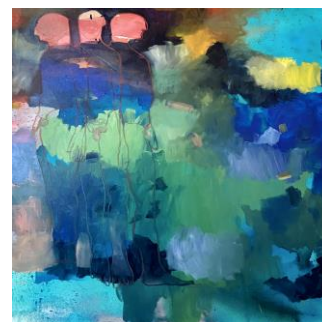
ALESSANDRA ROSSI Three Figures 153x100cm ink & oil on canvas $5200.