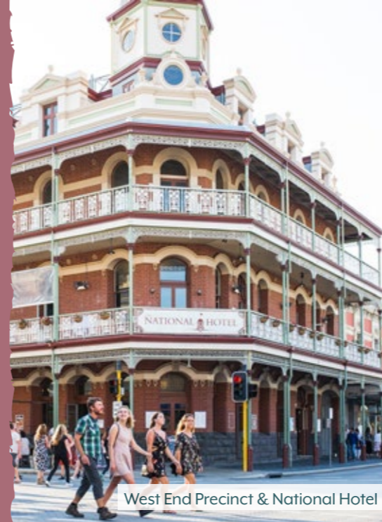
West End Precinct & National Hotel